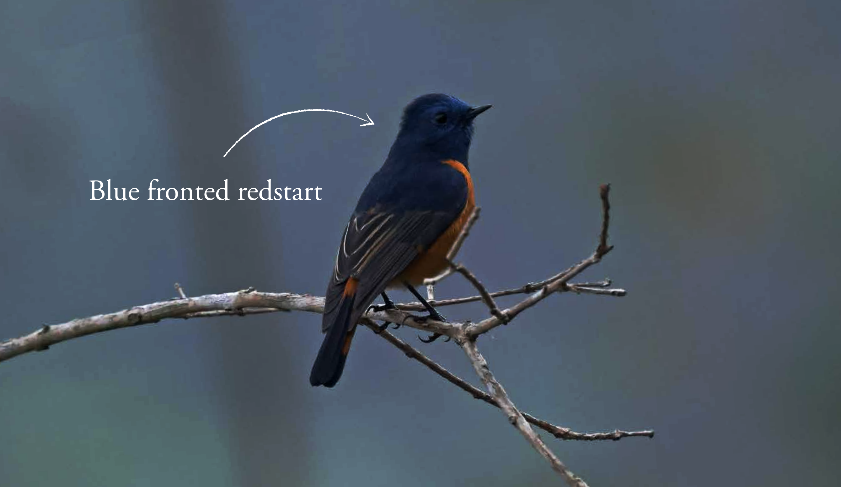
Blue fronted redstart