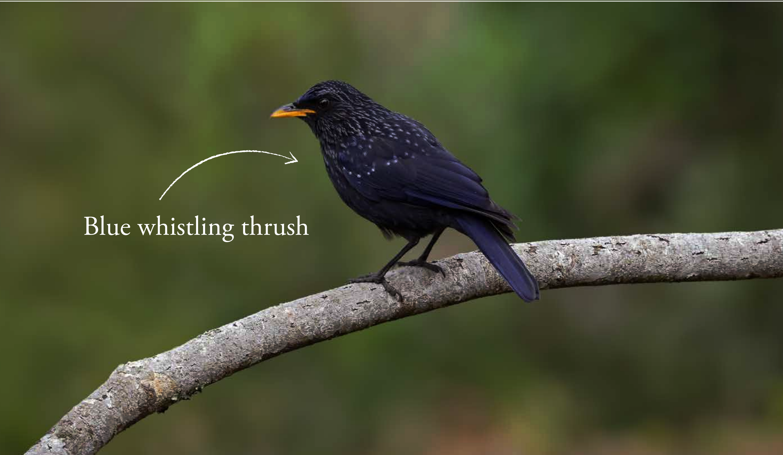
Blue whistling thrush