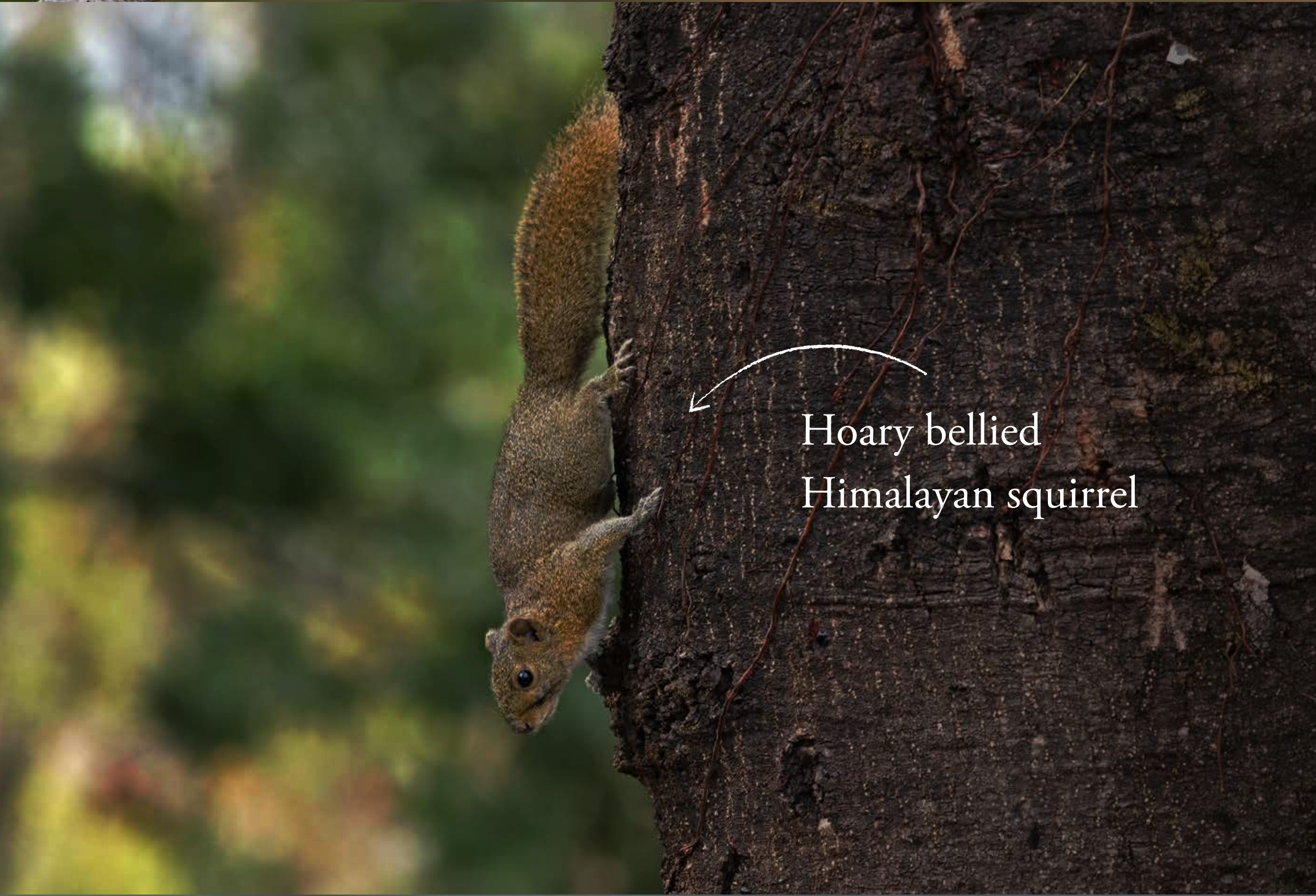
Hoary bellied Himalayan squirrel